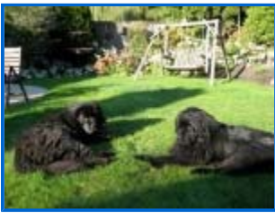
Max and Boston

“We were so excited as a family to adopt Max. He flew from Buffalo, New York, to Seattle, Washington, and out he came from the crate looking for who might be there for him...from that minute on, Newfies were our kind of dog! We were lucky enough to adopt Max’s half-sister (Boston) a year later. They were just the best of buddies. It has been a tough four months for Boston being an ‘only’ dog. We hope to add a new member to the family this summer some time.