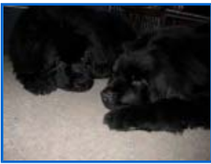
Boston watching over Max when he was sick.

“We were so excited as a family to adopt Max. He flew from Buffalo, New York, to Seattle, Washington, and out he came from the crate looking for who might be there for him...from that minute on, Newfies were our kind of dog! We were lucky enough to adopt Max’s half-sister (Boston) a year later. They were just the best of buddies. It has been a tough four months for Boston being an ‘only’ dog. We hope to add a new member to the family this summer some time.