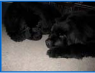
Boston watching over Max when he was sick.

“We were so excited as a family to adopt Max. He flew from Buffalo, New York, to Seattle, Washington, and out he came from the crate looking for who might be there for him...from that minute on, Newfies were our kind of dog! We were lucky enough to adopt Max’s half-sister (Boston) a year later. They were just the best of buddies. It has been a tough four months for Boston being an ‘only’ dog. We hope to add a new member to the family this summer some time.